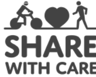
A 'Share with care' logo