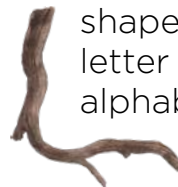
A stick shaped like a letter of the alphabet