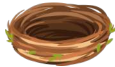
A bird nest