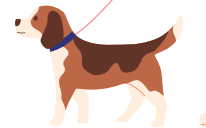
Someone walking a dog