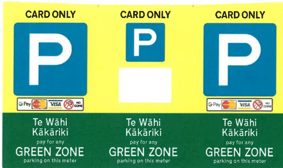
Green Zone, Card only meter sign

Specific guidance to the nearest available meter is provided by the meter helpline. In addition, usually the meter fault screen will advise the user to use another meter in the relevant Zone which are clearly indicated on the meters.