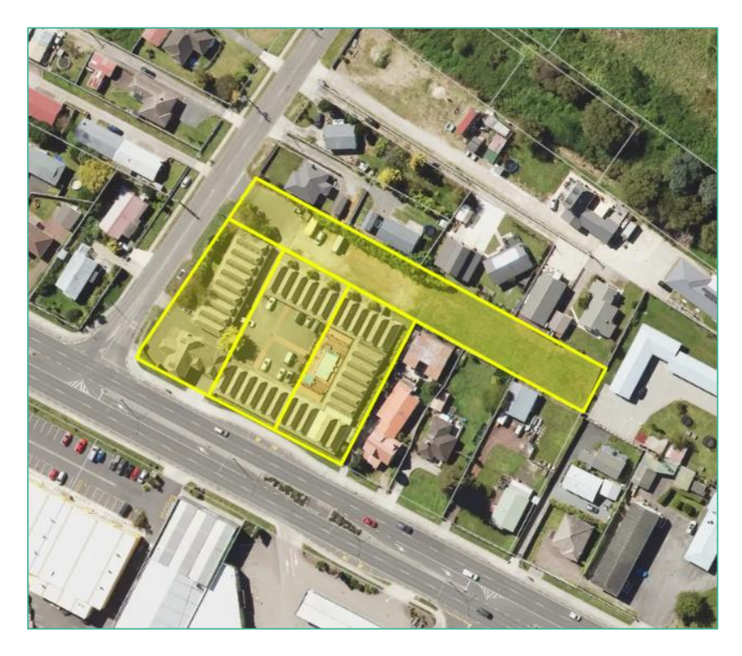
FIGURE 1: AERIAL IMAGE OF THE SITE

The 5,991m<sup>2</sup> corner site has frontage to Lake Road along its south-western boundary and Bennetts Road along its north-western boundary (see Figure 1 below). The site is comprised of land held within four records of title. All of the hotel buildings and facilities located within the three records of title have direct frontage onto Lake Road (129-131 Lake Road).