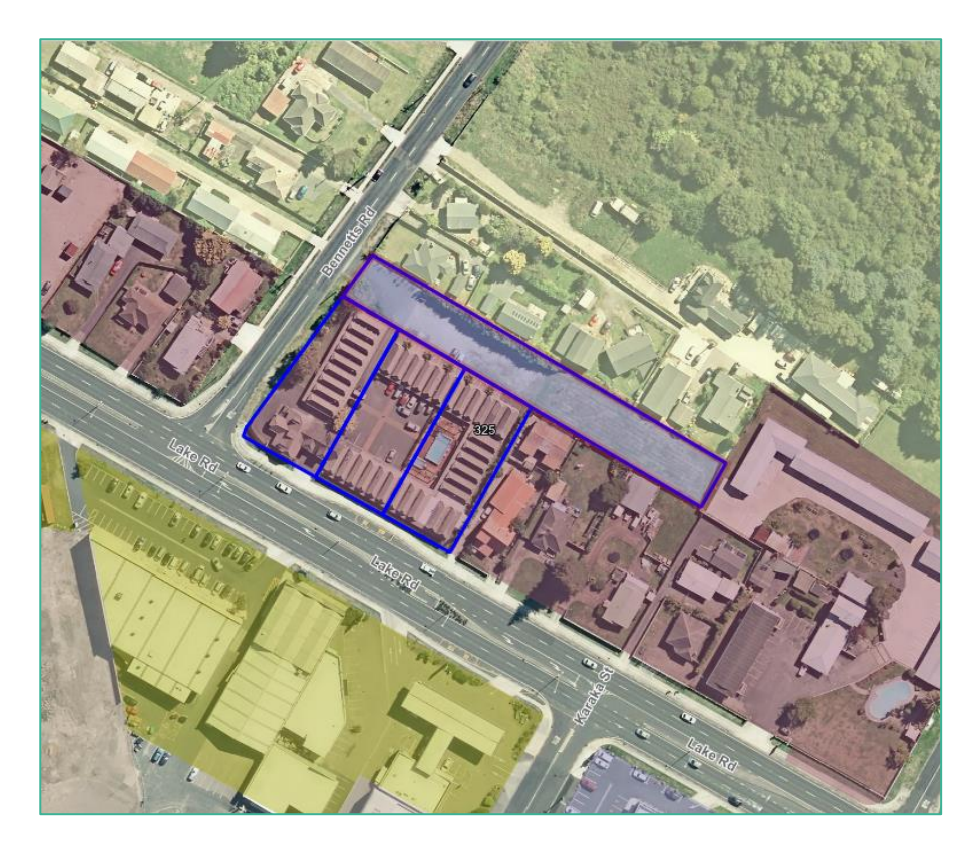
FIGURE 3: AERIAL IMAGE OF SUBJECT SITE SHOWING DISTRICT ZONING OVERLAY (SOURCE RDC INTRAMAPS)