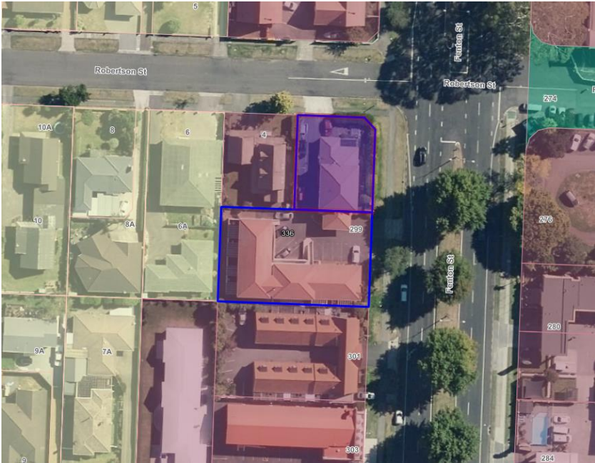
FIGURE 3: AERIAL IMAGE OF SUBJECT SITE SHOWING DISTRICT ZONING OVERLAY