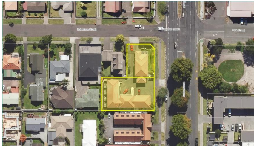
FIGURE 1: AERIAL PHOTOGRAPH OF THE SITE AT 299 FENTON STREET AND LOT 2 DPS 68941

The 1,530m 2 L-shaped subject site, Geneva Motor Lodge, is located across two parcels of land being 299 Fenton Street (Lot 108 DP 15716 and Lot 2 DPS 68941). The site has frontage to Fenton Street along its eastern boundary and Robertson Street along its northern boundary (see Figure 1 below). There have been no changes to the subject site which make it materially different from the existing environment described in the previous application.