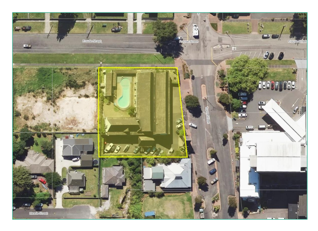
FIGURE 1: AERIAL IMAGE OF THE SITE

The 2,864m<sup>2</sup> site has frontage to Froude Street along its northern boundary and Tryon Street to its eastern boundary (see Figure 1 below). There have been no changes to the subject site which make it materially different from the existing environment described in the previous application.