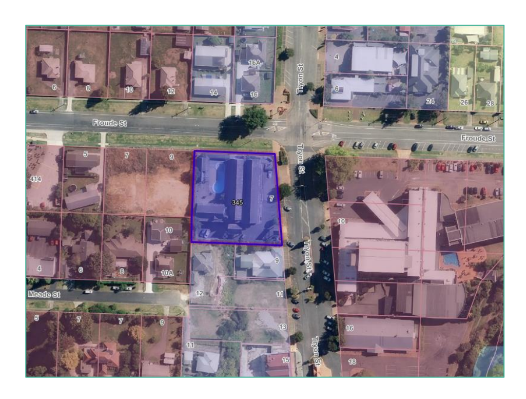
FIGURE 3: AERIAL IMAGE OF SUBJECT SITE SHOWING DISTRICT ZONING OVERLAY