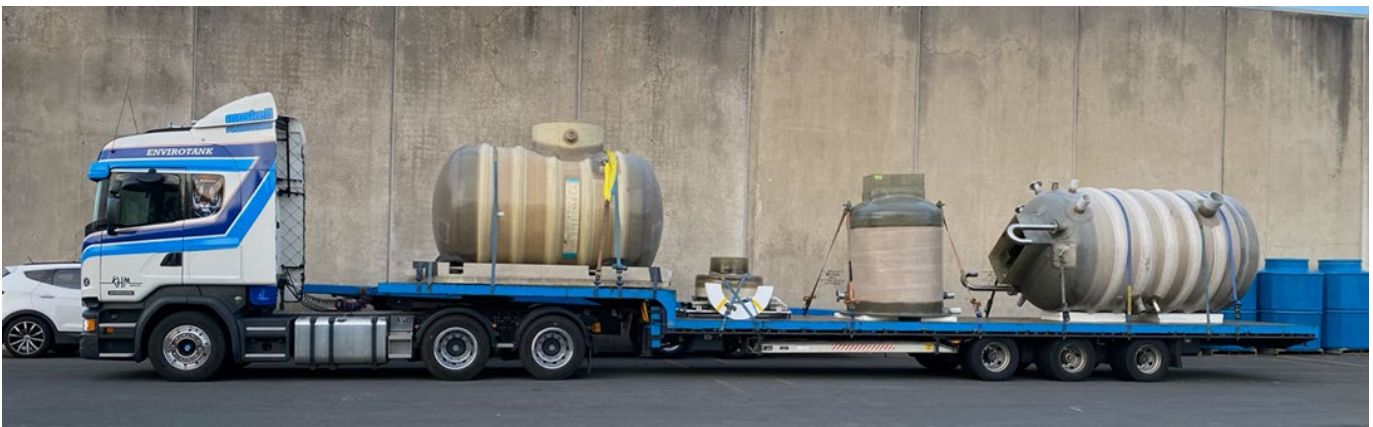
Chambers for the Cliff Road Pump Station

We ask that you please respect our team and travel safely through the worksites. Stick to the posted speed limit, drive carefully, and follow signage and any instructions you receive. Whether they're managing traffic to keep you safe or they're on the tools, the last thing we want is for our workers to cop abuse, be injured, or worse. Just as they work to make sure you can get to your destinations safely; our team need to be able to complete their tasks and return safely to their families each day.