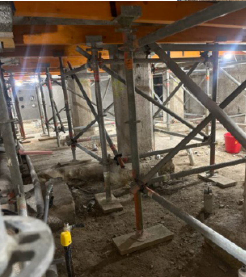
Zone 3 basement ceiling propping 26/11