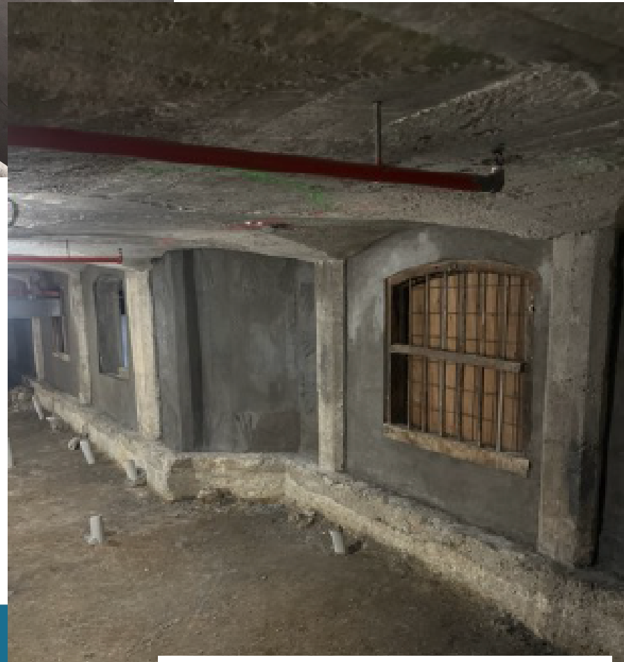
FRCM wall application 26/11