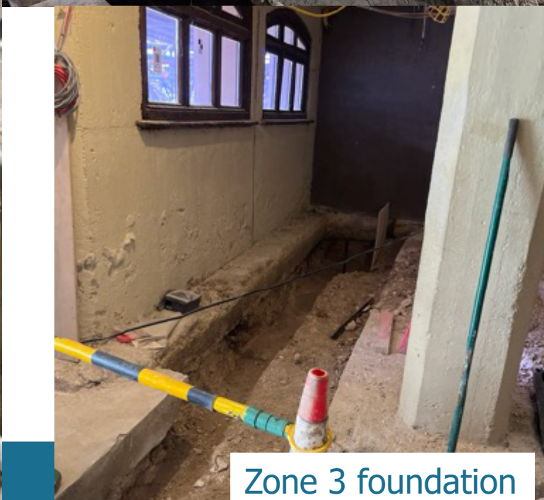
Zone 3 foundation excavation 02/12