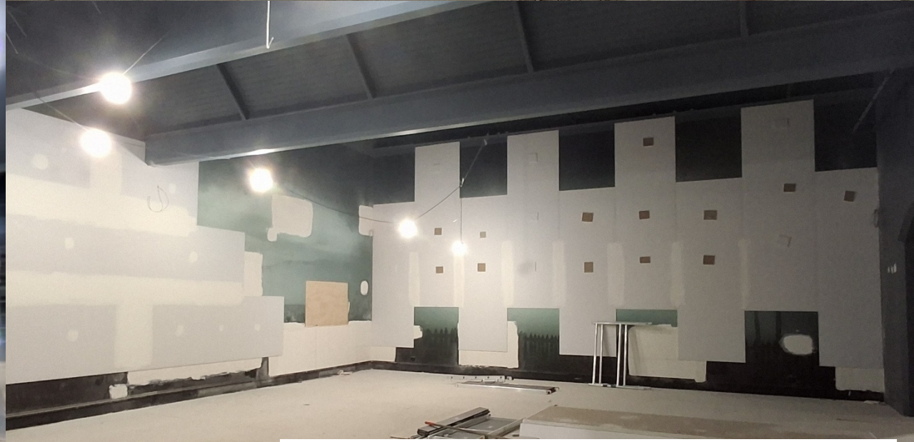
South Wing (zone 1) wall lining 30/10