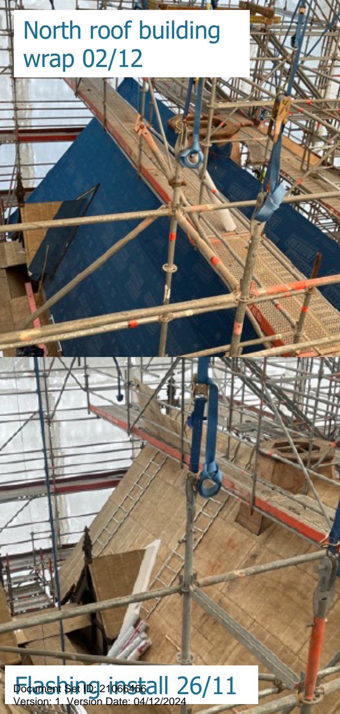
North roof building wrap 02/12