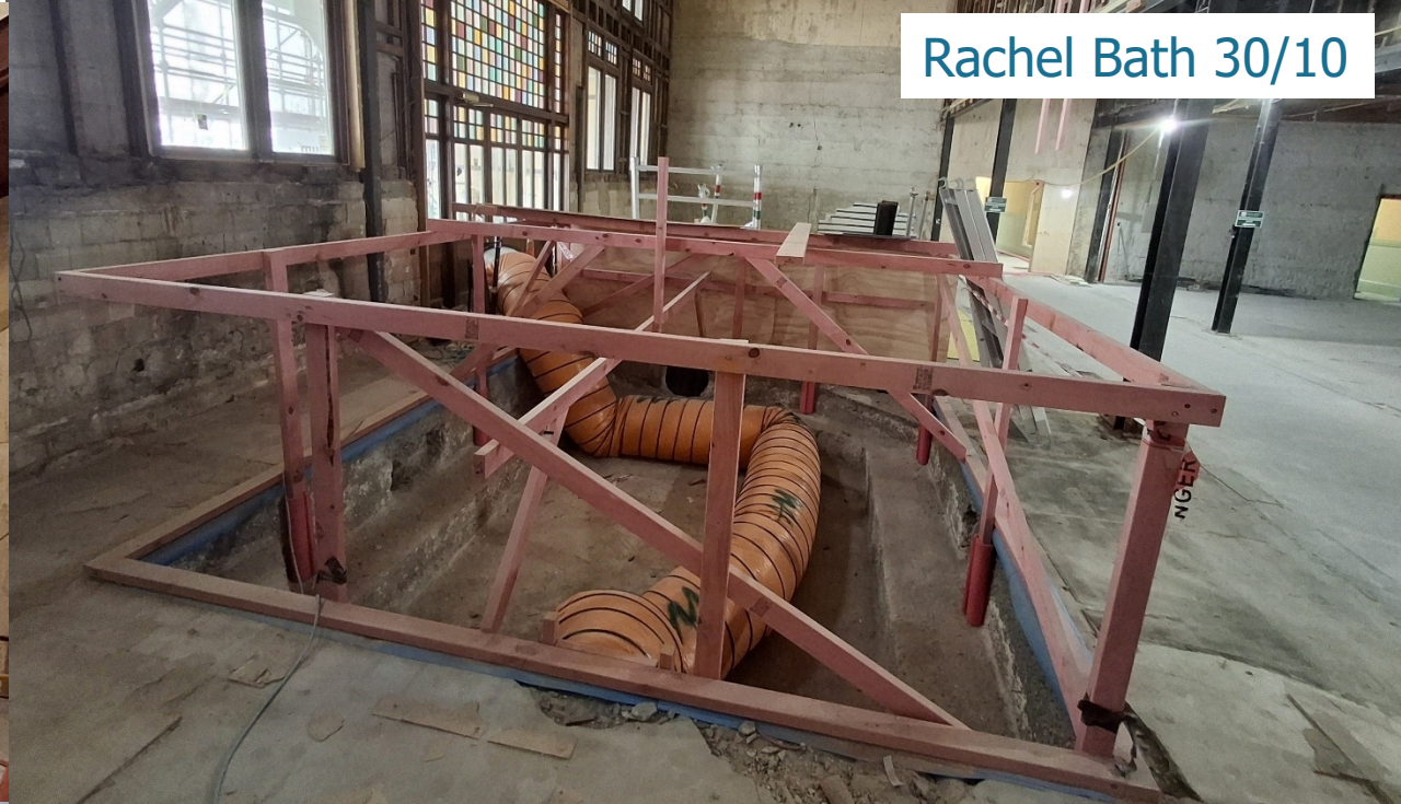
Rachel Bath 30/10