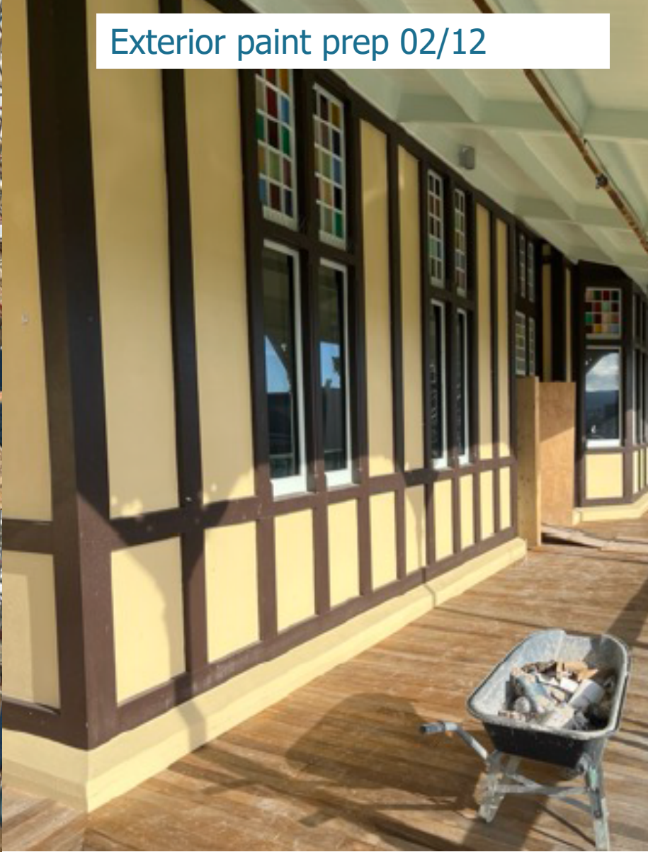
Exterior paint prep 02/12