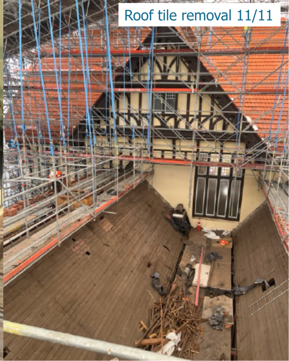
Roof tile removal 11/11