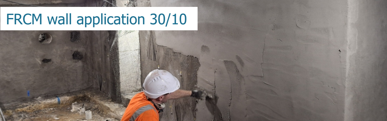
FRCM wall application 30/10